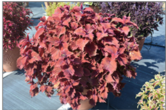
Under The Sea King Crab Coleus