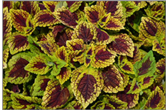
Stained Glassworks Raspberry Tart Coleus foliage