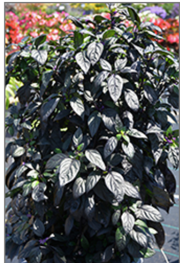
Black Pearl Ornamental Pepper