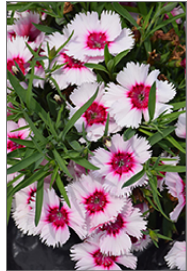
Super Parfait Raspberry Pinks flowers

Super Parfait Raspberry Pinks is a fine choice for the garden, but it is also a good selection for planting in outdoor pots and containers. It is often used as a 'filler' in the 'spiller-thriller-filler' container combination, providing a mass of flowers and foliage against which the thriller plants stand out. Note that when growing plants in outdoor containers and baskets, they may require more frequent waterings than they would in the yard or garden.