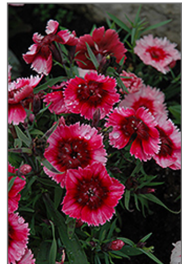
Super Parfait Raspberry Pinks flowers