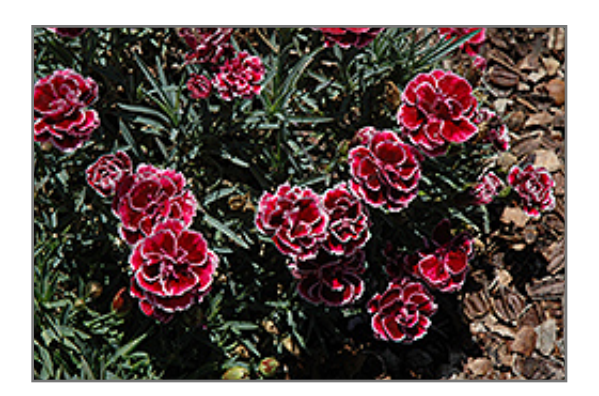
Sunflor Margarita Carnation flowers