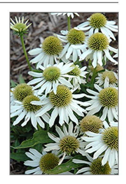
Snow Cone Coneflower flowers