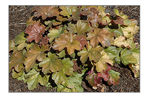
Carnival Coffee Bean Coral Bells foliage