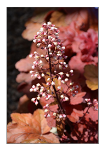
Fire Alarm Coral Bells flowers

This plant performs well in both full sun and full shade. However, you may want to keep it away from hot, dry locations that receive direct afternoon sun or which get reflected sunlight, such as against the south side of a white wall. It prefers to grow in average to moist conditions, and shouldn't be allowed to dry out. It is not particular as to soil type or pH. It is somewhat tolerant of urban pollution. Consider covering it with a thick layer of mulch in winter to protect it in exposed locations or colder microclimates. This particular variety is an interspecific hybrid. It can be propagated by division; however, as a cultivated variety, be aware that it may be subject to certain restrictions or prohibitions on propagation.