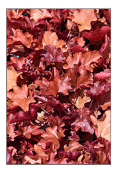
Fire Alarm Coral Bells foliage