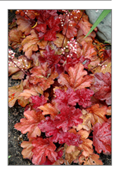
Fire Alarm Coral Bells