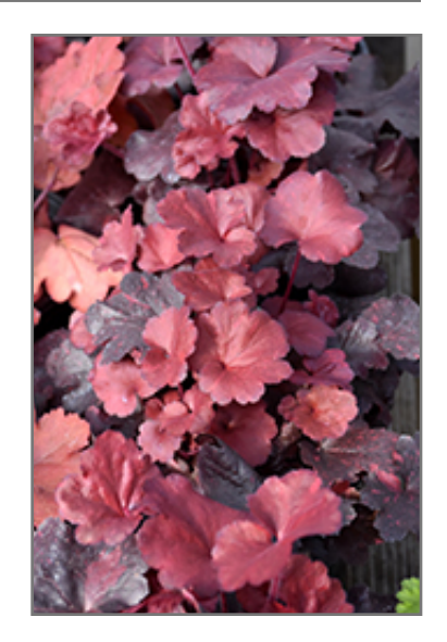
Galaxy Coral Bells foliage