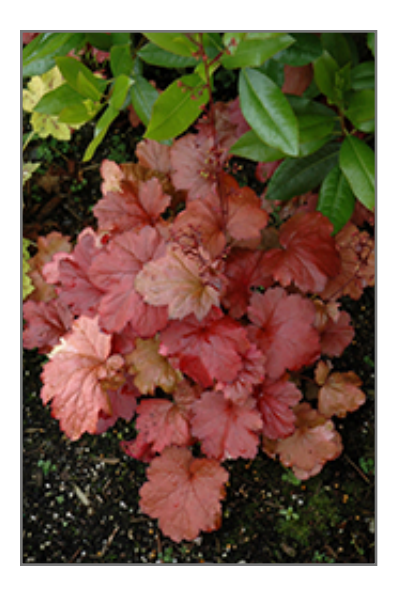
Galaxy Coral Bells