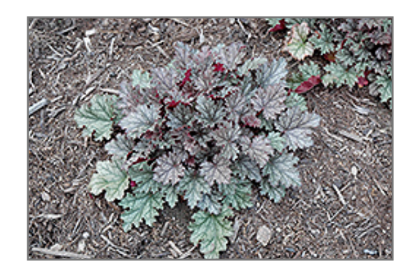
Kira Rockies Coral Bells foliage