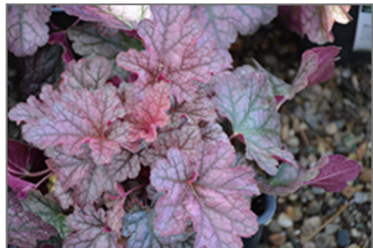
Kira Purple Rain Forest Coral Bells foliage