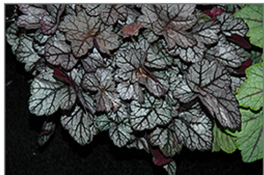
Glitter Coral Bells foliage