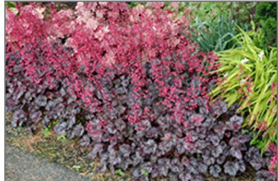
Glitter Coral Bells in bloom

Glitter Coral Bells is recommended for the following landscape applications;