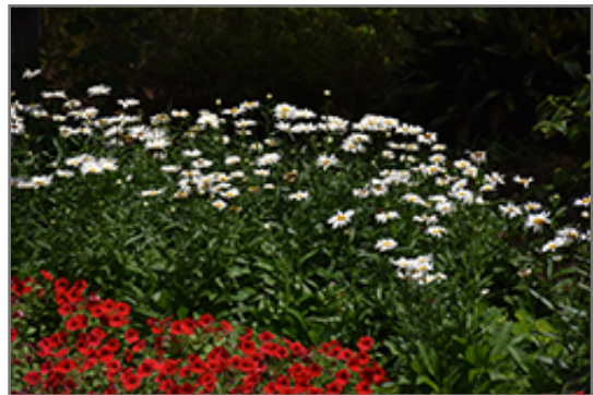
Brightside Shasta Daisy in bloom