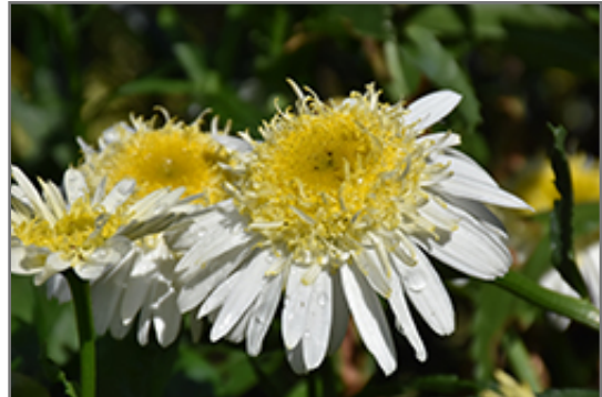
Realflo Real Glory Shasta Daisy flowers