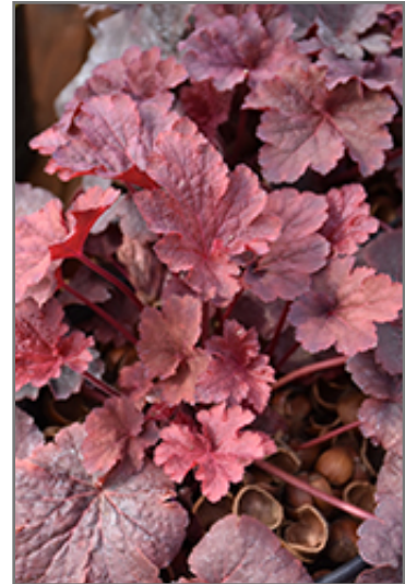
Cajun Fire Coral Bells foliage