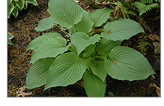
Fall Emerald Hosta

Lighter green emerging leaves mature to dark emerald green and hold their color well into fall; spikes of pale lavender flowers in mid-summer; a rich green for the garden or border