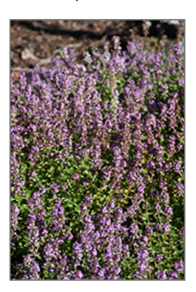
Lemon Thyme flowers