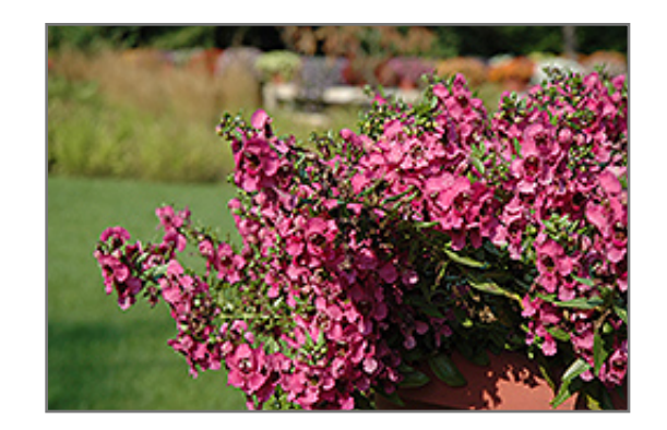
Carita Cascade Raspberry Angelonia flowers