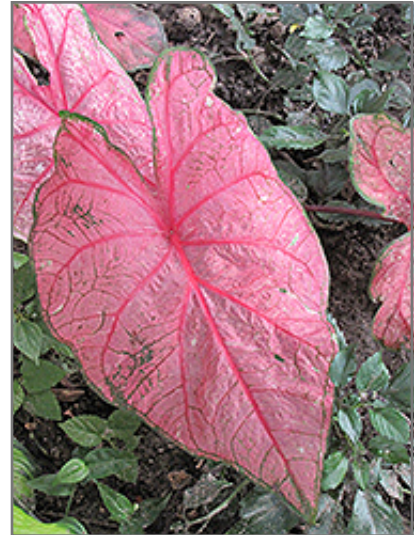
Fannie Munson Caladium foliage