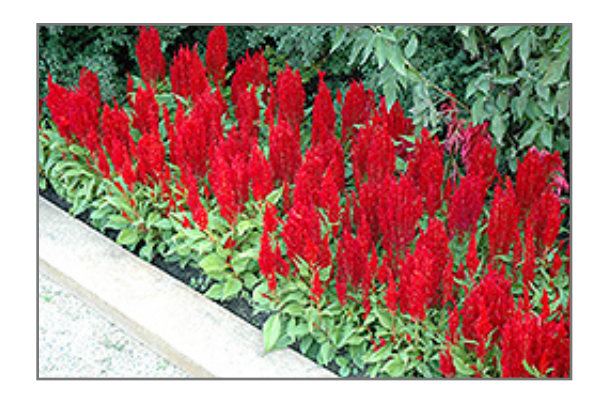
Arrabona Red Plumed Celosia in bloom