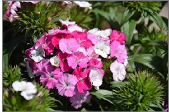
Amazon Rose Magic Pinks flowers

Amazon Rose Magic Pinks is recommended for the following landscape applications;