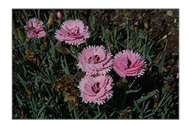
EverLast Lavender plus Eye Pinks flowers