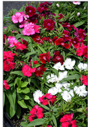
Floral Lace Mix Pinks flowers