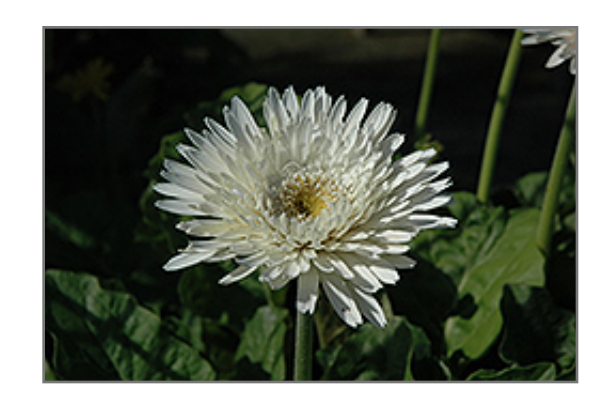
Funtastic Blush Gerbera Daisy flowers