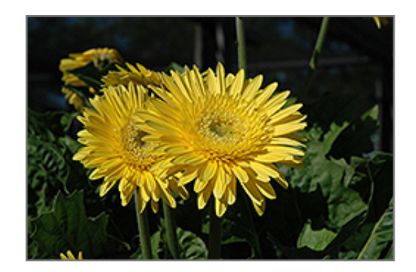
Funtastic Canary Gerbera Daisy flowers