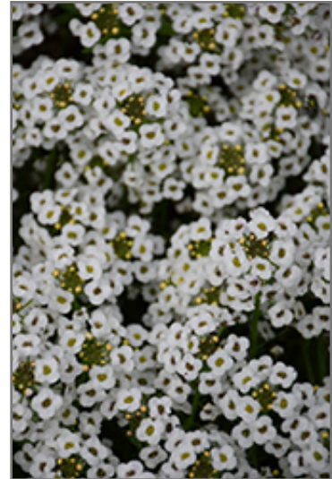
Stream White Sweet Alyssum flowers