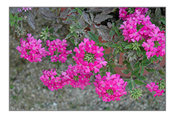
Vegas Plus Rose With Eye Verbena flowers