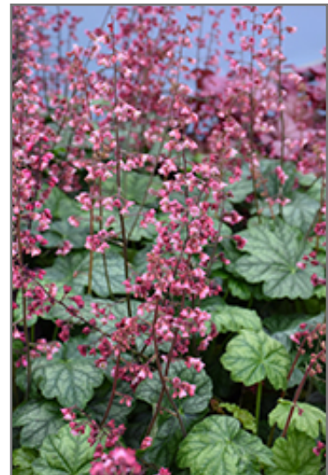
Berry Timeless Coral Bells flowers