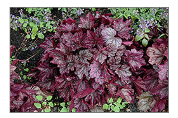
Dolce Blackberry Ice Coral Bells foliage