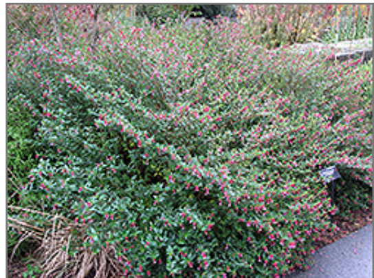
Starfire Pink Firecracker Plant in bloom