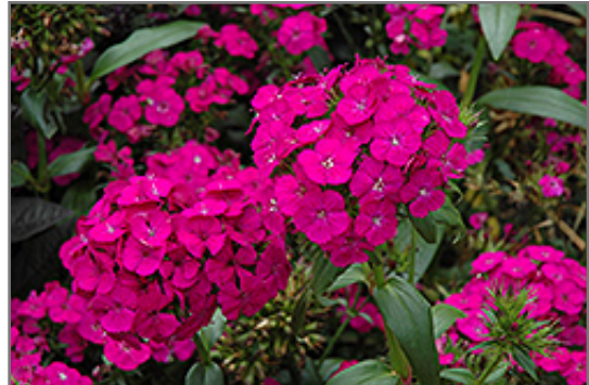
Amazon Neon Purple Pinks flowers

Amazon Neon Purple Pinks is recommended for the following landscape applications;