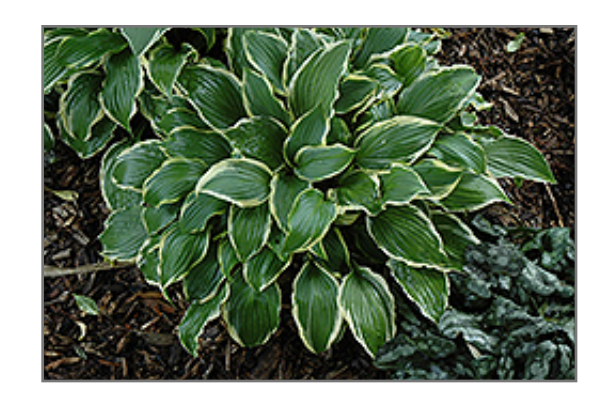
Rubies And Ruffles Hosta