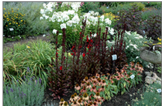
Vulcan Red Lobelia in bloom