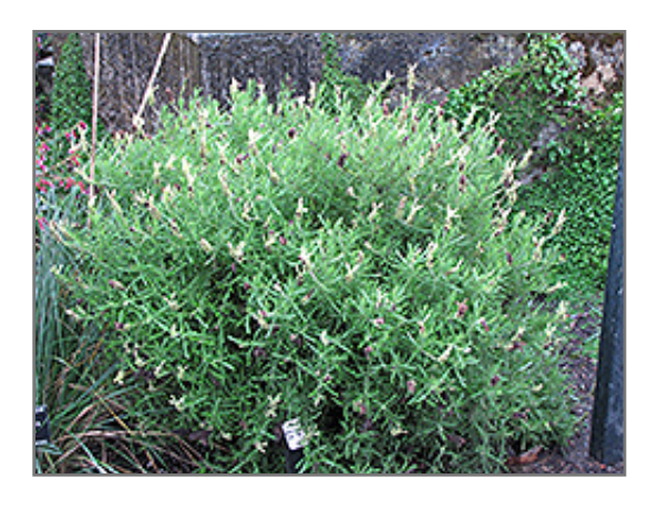
Lemon Leigh Lavender in bloom

This is a relatively low maintenance shrub, and can be pruned at anytime. It is a good choice for attracting bees and butterflies to your yard, but is not particularly attractive to deer who tend to leave it alone in favor of tastier treats. It has no significant negative characteristics.