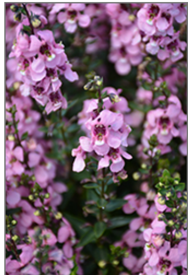
Serenita Pink Angelonia flowers