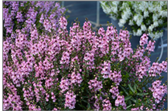
Serenita Pink Angelonia in bloom

Serenita Pink Angelonia is a fine choice for the garden, but it is also a good selection for planting in outdoor containers and hanging baskets. It is often used as a 'filler' in the 'spiller-thriller-filler' container combination, providing a mass of flowers against which the larger thriller plants stand out. Note that when growing plants in outdoor containers and baskets, they may require more frequent waterings than they would in the yard or garden.