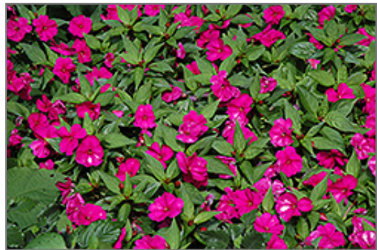
Big Bounce Violet Impatiens in bloom