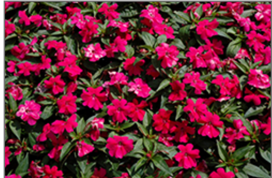
Bounce Cherry Impatiens flowers