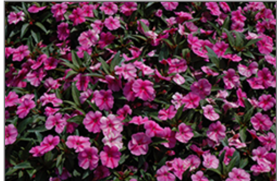
Bounce Pink Flame Impatiens flowers