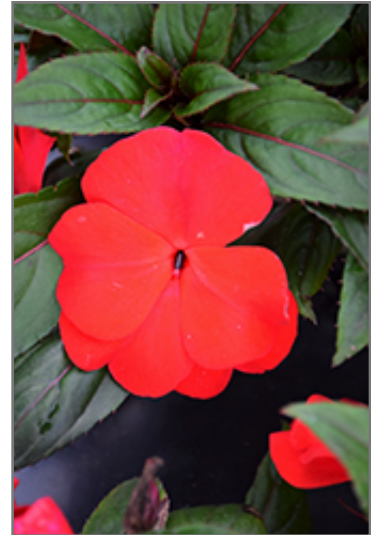
Divine Scarlet Bronze Leaf New Guinea Impatiens flowers

Divine Scarlet Bronze Leaf New Guinea Impatiens is recommended for the following landscape applications;