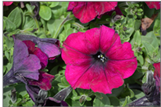
Easy Wave Burgundy Velour Petunia flowers