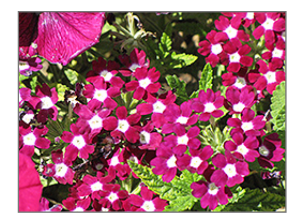
Quartz XP Burgundy With Eye Verbena flowers