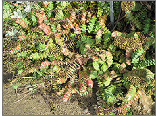
String Of Buttons