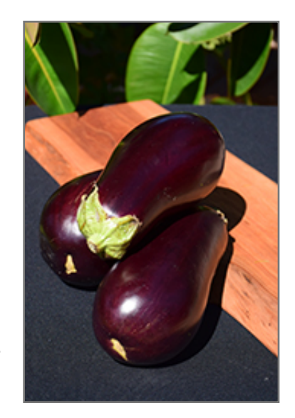
Eggplant fruit

17999 WCR 4 Brighton, CO, 80603 phone: 303-775-9629 www.incolorme.com