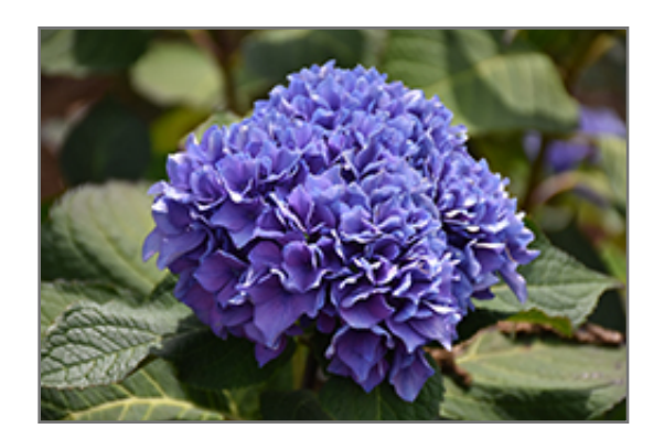
Let's Dance Rhythmic Blue Hydrangea flowers