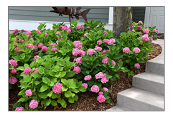
Let's Dance Rhythmic Blue Hydrangea in bloom