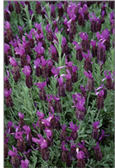
Anouk Supreme Spanish Lavender flowers