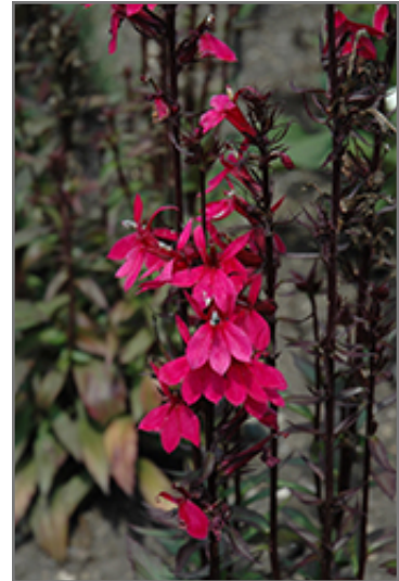
Starship Deep Rose Lobelia flowers