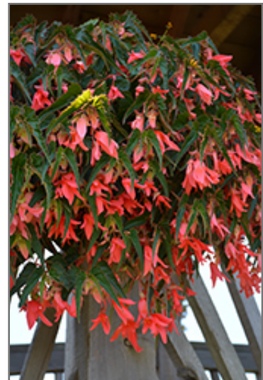
San Francisco Begonia in bloom