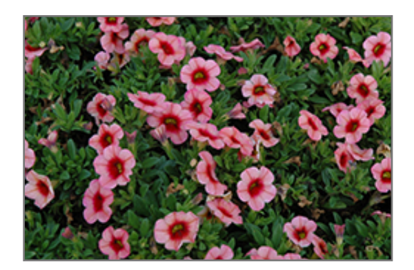
Conga Coral Kiss Calibrachoa flowers