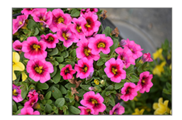
Conga Rose Kiss Calibrachoa flowers