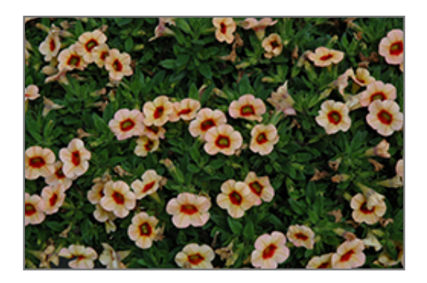
Conga Sun Kiss Calibrachoa flowers